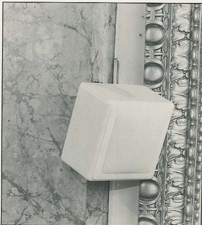
One of the speaker placements

Pope's decision to appear for Evening Prayer Vespers in its Chapel of Saints Peter and Paul was an incomparable occurrence.