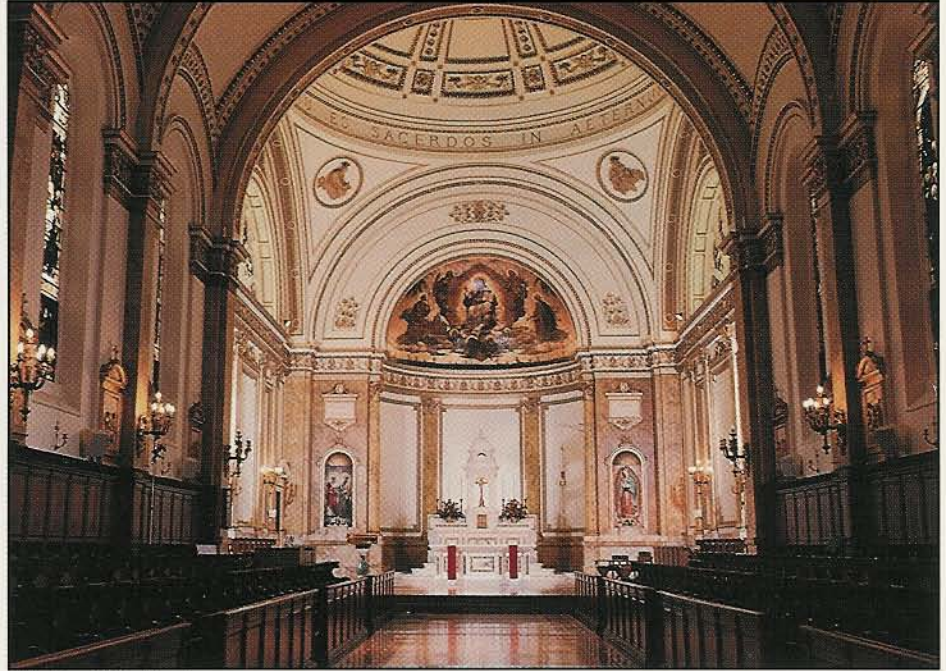
St. Joseph's Seminary

Disembarking, Pope John Paul II greeted the followers at the chapel's