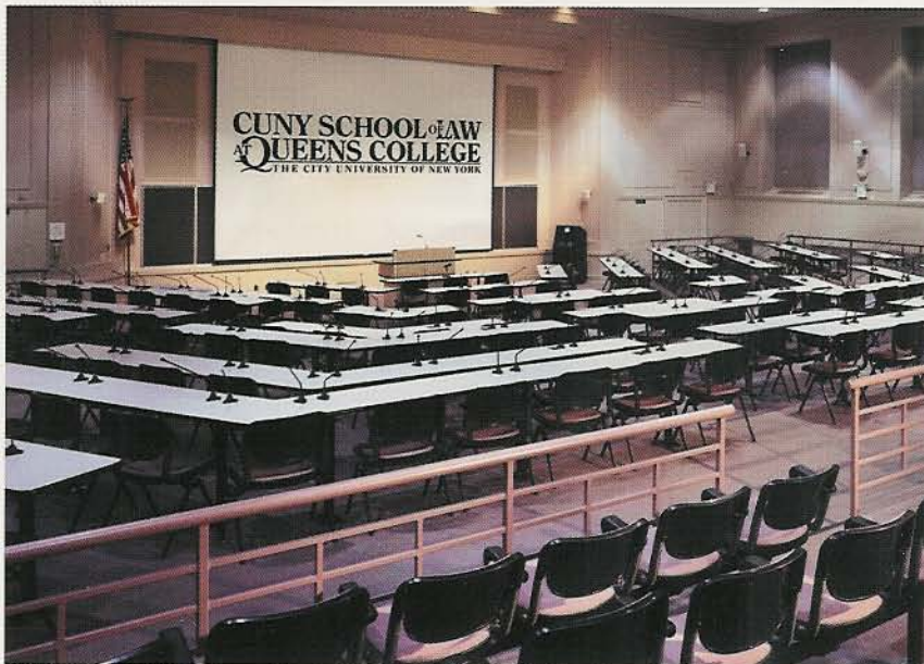
▲ The City University of New York Law School at Queens College in Flushing, NY has upgraded the sound system in the school's main lecture hall. A total of 159 Audio-Technica Engineered Sound ES905/H rigid-pipe microphones (below, right) were installed in the hall.